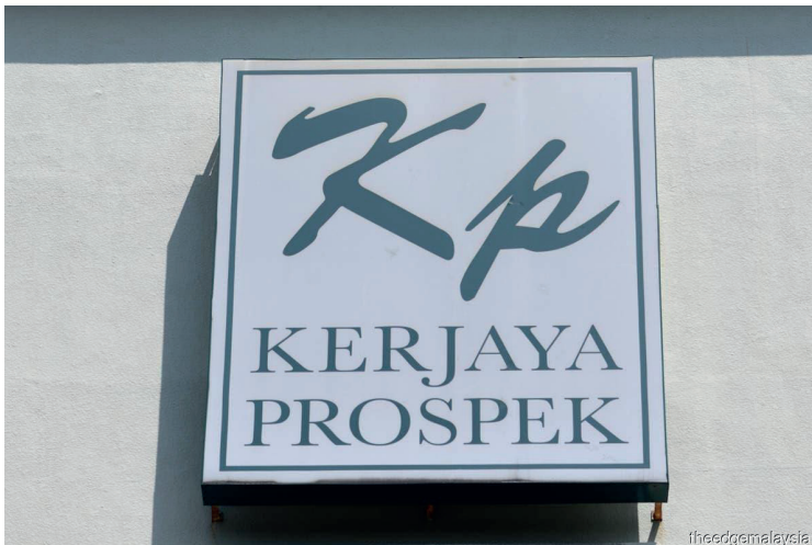
The lawsuit is still ongoing, with trial dates set for October this year.